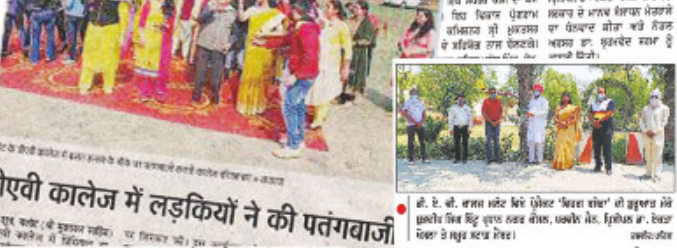
डीएवी कॉलेज में लड़कियों ने की पतंगवाजी।

डी.ए.वी. कॉलेज मलोट में लड़कियों ने पतंगवाजी का आयोजन किया गया। छात्रों ने उत्कृष्ट प्रदर्शन किया।