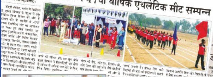
डी.ए.वी. कॉलेज मलोट में 47वीं वार्षिक एथलेटिक मीट सम्पन्न।