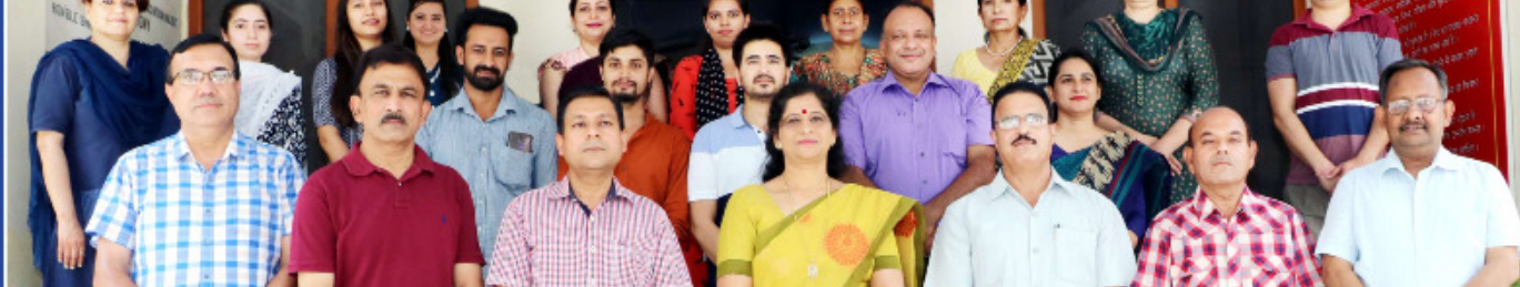
विद्यार्थियों को पेटेंट अधिकार कानून के बारे में बताया।

संवाद सुभ, मलोट (श्री सुभाकर साहिब) : डीएवी कॉलेज मलोट में विद्यार्थियों को पेटेंट अधिकार कानून के बारे में बताया गया।